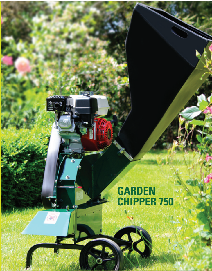
GARDEN CHIPPER 750