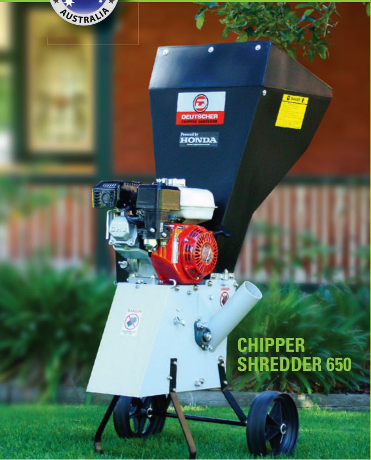
CHIPPER SHREDDER 650